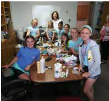
Brownie Troop 99 made and serve lunch for Day Guests.

This group is so helpful in the many tasks around our church. Helping with the Day Guest Program, cleaning the nursery room toys, putting new brochures in the pews, and setting tables for WNS. In addition, they wash the mugs from Sunday Fellowship—so our mugs are back. We do appreciate the donor of the paper cups.