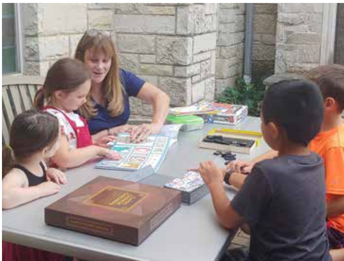
Baker Kids took advantage of the great weather to meet outside on a recent Wednesday night.