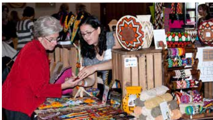
Check out the Purchase With A Purpose Market on April 7.