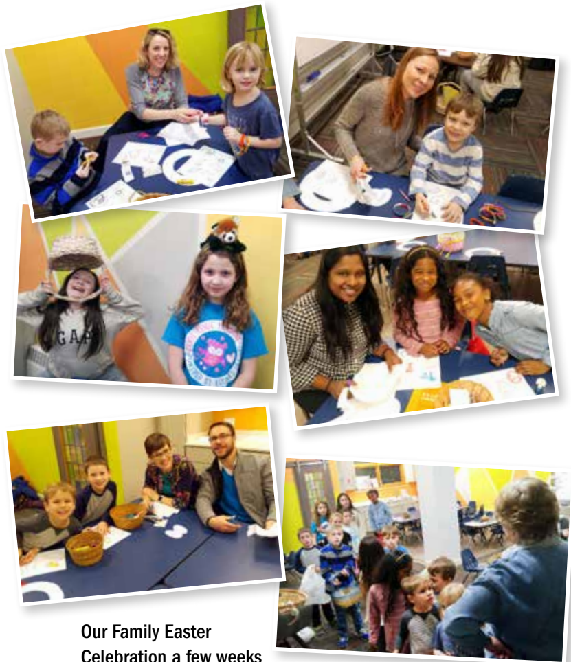
Our Family Easter Celebration a few weeks ago was an egg-citing event for the whole family.

Wrap Up: Perhaps your family can create an expression of faith through words with a poem or story. It doesn't have to be about spring or Easter. It is more about family time to rejoice in God's love. Please feel free to share with me and we'll display it on the Children and Family bulletin board.