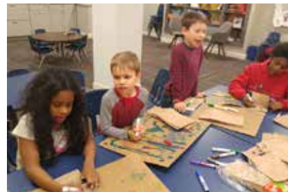
Our Baker Kids program put its artistic skills to good use and decorated placemats for the Kairos Prison Ministry.

I am thankful for the Lord blessing our Baker Church family with so many talents and skills. We have had a busy year, and still look forward to a busier summer with VBS. May the Lord continue to help us improve our skills and bless others!